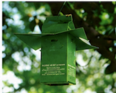
Milk carton trap