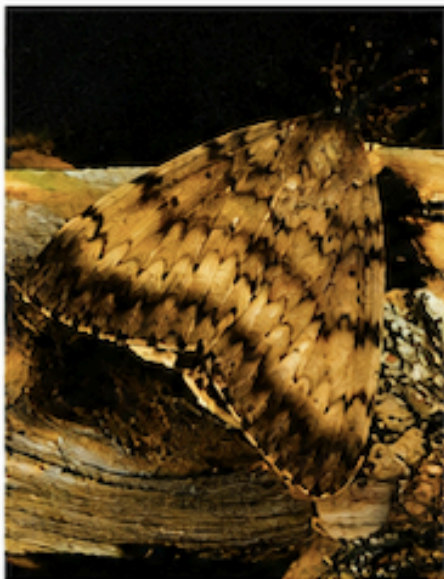
Spongy moth adult male