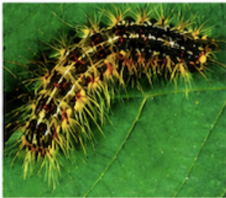
Spongy moth caterpillar

Animal and Plant Health Inspection Service U.S. DEPARTMENT OF AGRICULTURE