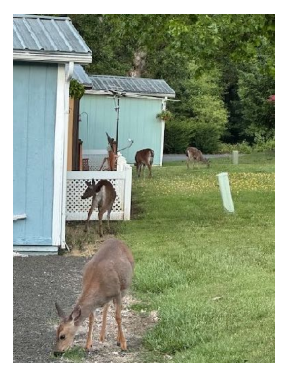
A few of our friends roaming around