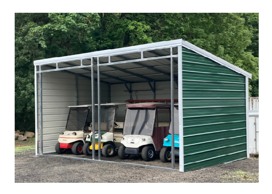
New shed!