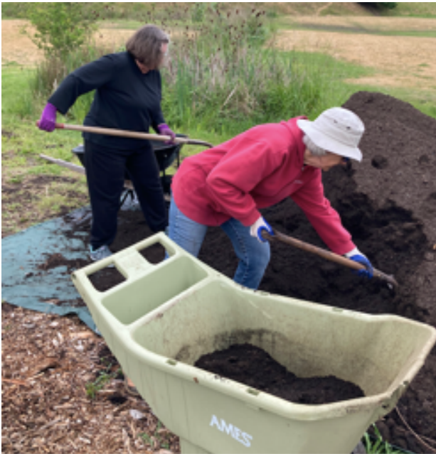
Baby AMES Bumpy Buggy at work!

fun provided by gardeners!